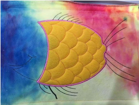
Stitch the eye details