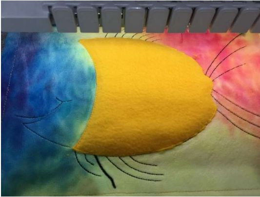
Stitch the satin stitch covering the fabric for the scales