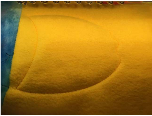
Trim around the scaels fabric