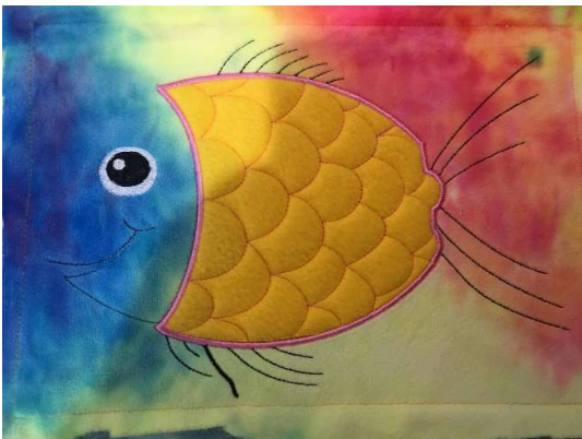
Cover the fish with the backing fabric